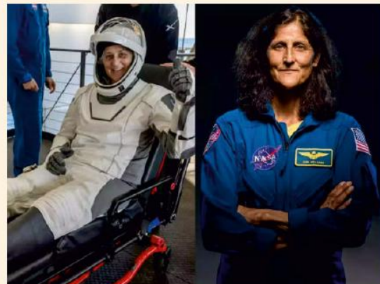
Sunita Williams Took a Ganesh Idol & Shrimad-Bhagvad-Gita with her to International Space Station (ISS)